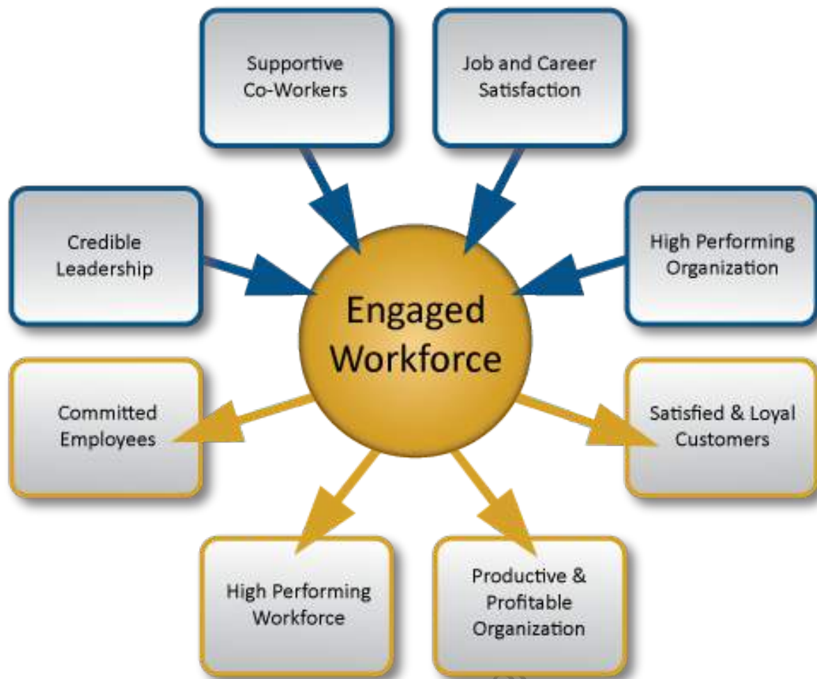
Engaged Workforce Model

When considering the factors that are impacted by lack of engagement, we typically think of the people factors like lowered employee morale and more stress. Because disengagement and attrition directly align with organizational effectiveness, these can also have a great impact on operational factors such as lost productivity, which was cited by 66 percent of organizations surveyed and lost organizational knowledge affecting 54 percent of organization surveyed. The operational costs associated with disengaged employees often far exceed the costs of turnover.