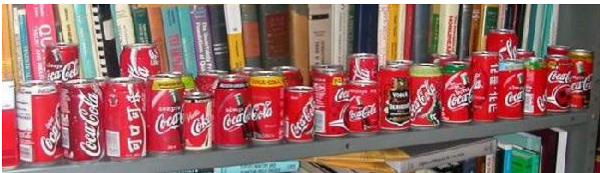
Coke Bottle in Different Countries

In which languages should labelling and instructions be printed? One approach to this issue is to print labels and instructions in languages that are used in all of the major markets for the product. The use of multiple languages on labels and instructions simplifies inventory control: The same packaging can be used for multiple markets. The savings from simplicity must be weighed against the cost of longer instruction booklets and more space on labels for information.