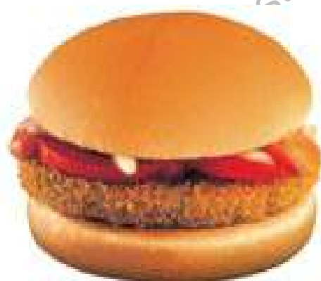
McAloo Tikki, India

Even the headquarters needs to listen to local managers and do not rigidly implement their standardized marketing mix in countries showing distinctive customer preferences or needs. The success of global marketing is based on gaining cooperation from affiliates' managers in implementing the strategy. The approach of the headquarters towards affiliates has to focus on both the means and the ends.