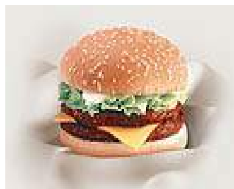
Bulbogi Burger, Korea